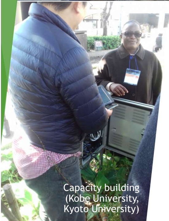
Capacity building (Kobe University, Kyoto University)